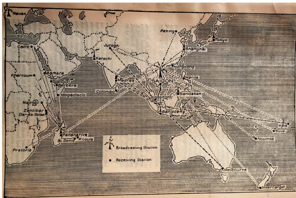
FIGURE 5: Map of wireless stations that participated in the League's epidemiological intelligence system in 1928. Receiving stations could only receive information, not send it. Broadcasting stations could both send and receive. League of Nations Archives, Geneva, 8D/R5980/435, C.48.M.29.1929.III, Eastern Bureau, Annual Report for 1928 and Minutes of the Fourth Session of the Advisory Council Held in Singapore, February 14 to 16, 1929 , 3. Reproduced by permission from the League of Nations Archives.

goods. At the same time, the maps concealed the hierarchies of access to information: only colonial and elite public health officials and ships' captains received the information; colonial populations were excluded from receiving it or deciding how to act on it.