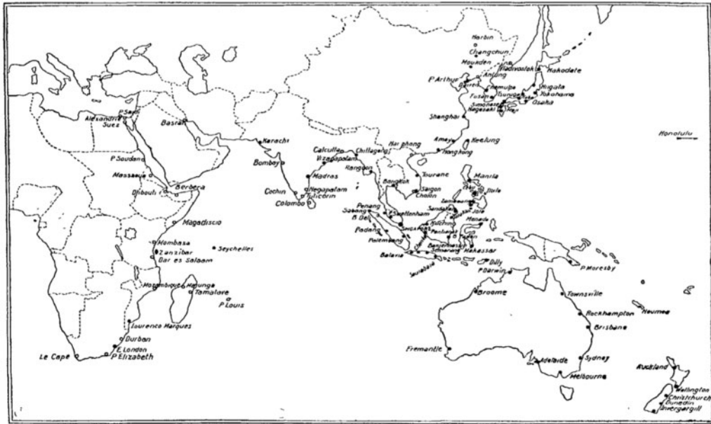
FIGURE 2: Map of port cities supplying information to the Eastern Bureau in 1926. Most of these cities initially cabled their weekly reports to Singapore and mailed supplemental, more detailed information. Weekly Record No. 10 of Reports Regarding the Prevalence of Plague, Cholera, Yellow Fever, Typhus and Smallpox Received by the Health Section during the Week Ended June 3rd, 1926 (Geneva, June 4, 1926), 4, https://apps.who.int/iris/handle/10665/237367 .

Rapports télégraphiques hebdomadaires sont reçus des 104 villes indiquées ci-dessous : Weekly Telegraphic Reports are received from the 104 Towns shown below :